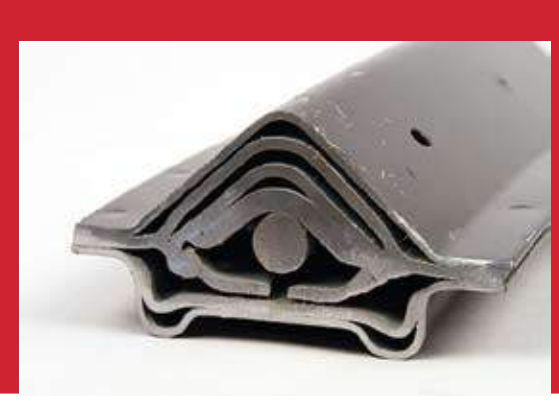
Figure 1 - A cutaway of a B-pillar from a 2000 Subaru Legacy Outback wagon shows multiple reinforcements.

engineer's intent. The tailored blank may be used to absorb energy (a collapse zone), or to transfer energy (a type of reinforcement). Some tailored blanks are easier to identify than others. Tailor-welded blanks may have a visible laser weld seam identifying it as a tailored blank. However, tailor-rolled blanks make identification more difficult. Tailor-rolled blanks may vary a fraction of a millimeter in a given area. The Dodge Caliber, for example, has areas on the B-pillar that are 1.00, 1.05, 1.65, 1.75, 1.85, and 1.9 mm thick on the same part. (see Figure 3).