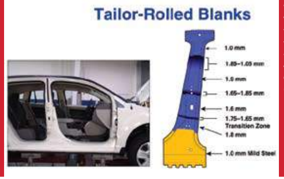
are different strengths of steel but no laser welds Caliber B-pillar.